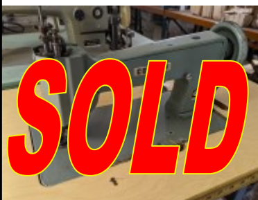
Consew Model 104 Single Needle Embroidery Manual Operation $895.00