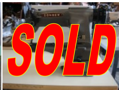
Consew Model 207 Single Needle, Cylinder Darning & Mending Machine $695.00