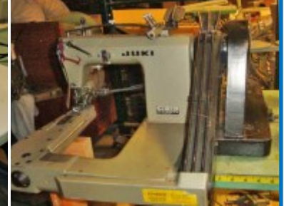
Juki M# MS-261 3 NDL Off the Arm Chain Stitch w/Puller $1,190.00