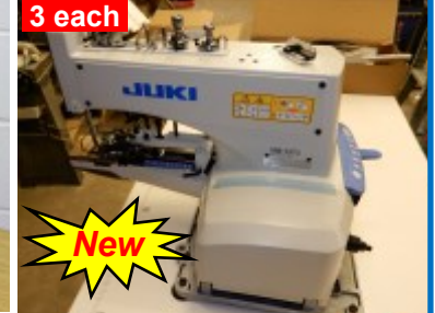
Juki Model MB-1373 NEW Button Sew Machine Manual Operation $2,995.00 each