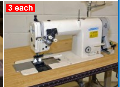
Juki M# LH-1152 2 NDL, Lock Stitch 1/4" NDL Gauge, Manual $795.00 each