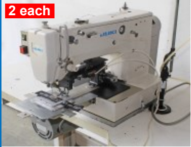
Juki M# AMS-206C Programmable Pattern Sewer Condition Not Known...Sold AS IS $495.00 each