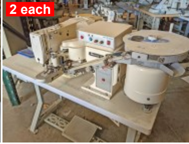
Juki LK-1900 (China Copy) Lock Stitch Button Sew w/ BR-120M Hopper $3,995.00 each