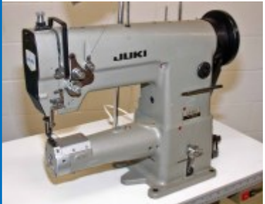
Juki Model LS-321 Single Needle, Needle Feed Cylinder, Manual BT & FL $995.00