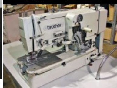
Brother LBH-B816 Lock Stitch Button Hole $1,525.00