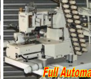
K.S. Model FX-4412P 12 Needle Cylinder Chainstitch w/ Puller $3,250.00