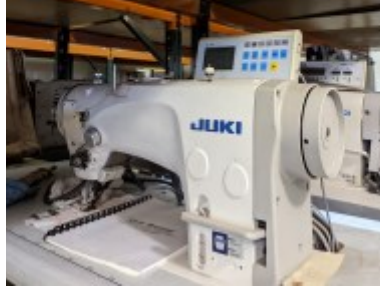
Juki Model LZ-2290-7 SN, Zig Zag, Programmable Chinese Copy of Juki $1,850.00