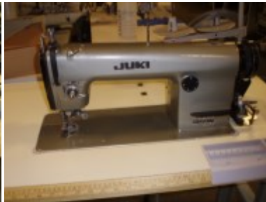
Juki Model DLM-522 Single Needle Lock Stitch With Right Side Trimmer $695.00