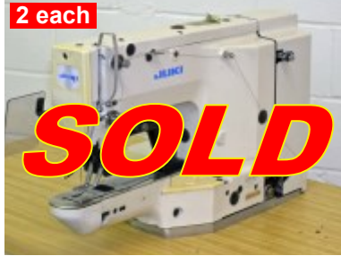
Juki Model LK-1852 Bar Tack Sewing Machine 28 Stitch, up to 5/8" long $995.00 each