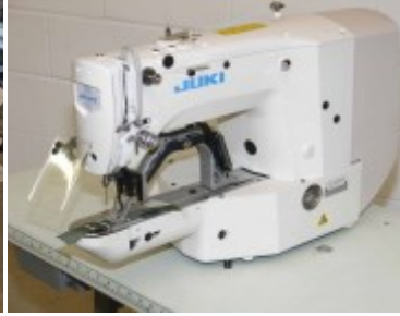
Juki LK-1900 (China Copy) Programmable Bar Tack Set up as a Button Sew $1,450.00