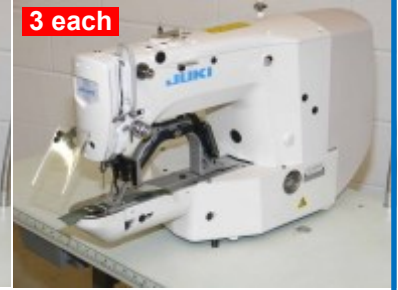
Juki LK-1900 (China Copy) Programmable Bar Tack Set up as a Bar Tack Sewer $1,450.00 each