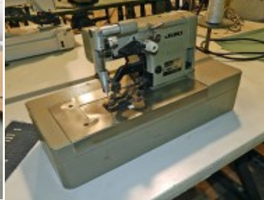
Juki M# MBH-180 Chain Stitch Button Sew $650.00