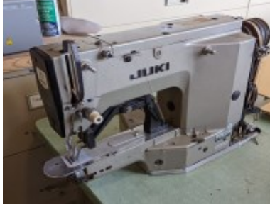
Juki M# LK-1854 Bar Tack Sewing Machine $695.00