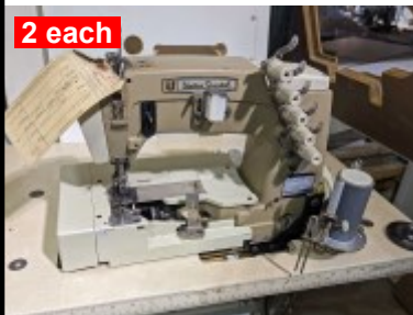
Union Special Model FS12C209MXA03 Coverstitch Binder/Elastic Feed $1,250.00 each