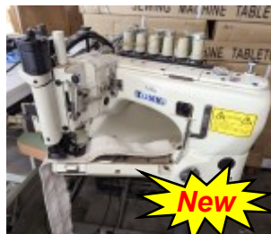
Tony Model H-35800 3 Needle Chainstitch Off Arm for Jeans $3,750.00