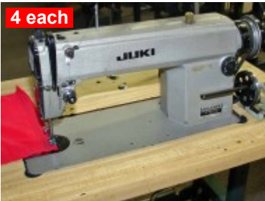
Juki Model DDL-5550 Single Needle Lockstitch Manual, No Auto Functions $395.00 each