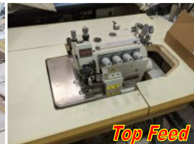
Pegasus Model EXT-3216 5 Thread Safety Serger Front Top Feed $2,250.00