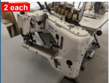
Juki Model 36200U300 Off The Arm Flat Seam Needle Pos/Pneumatic FL $2,995.00 each