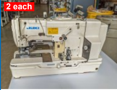
Juki Model LBH-782 Lock Stitch Button Hole 2 Pedal Manual Foot Lift $1,995.00 each